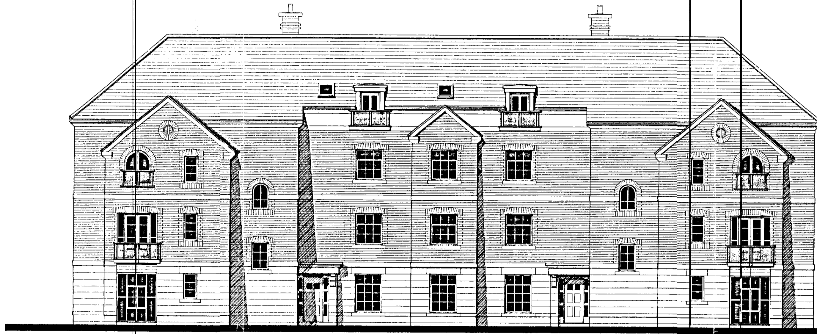
Rear Elevation 1:100 as proposed