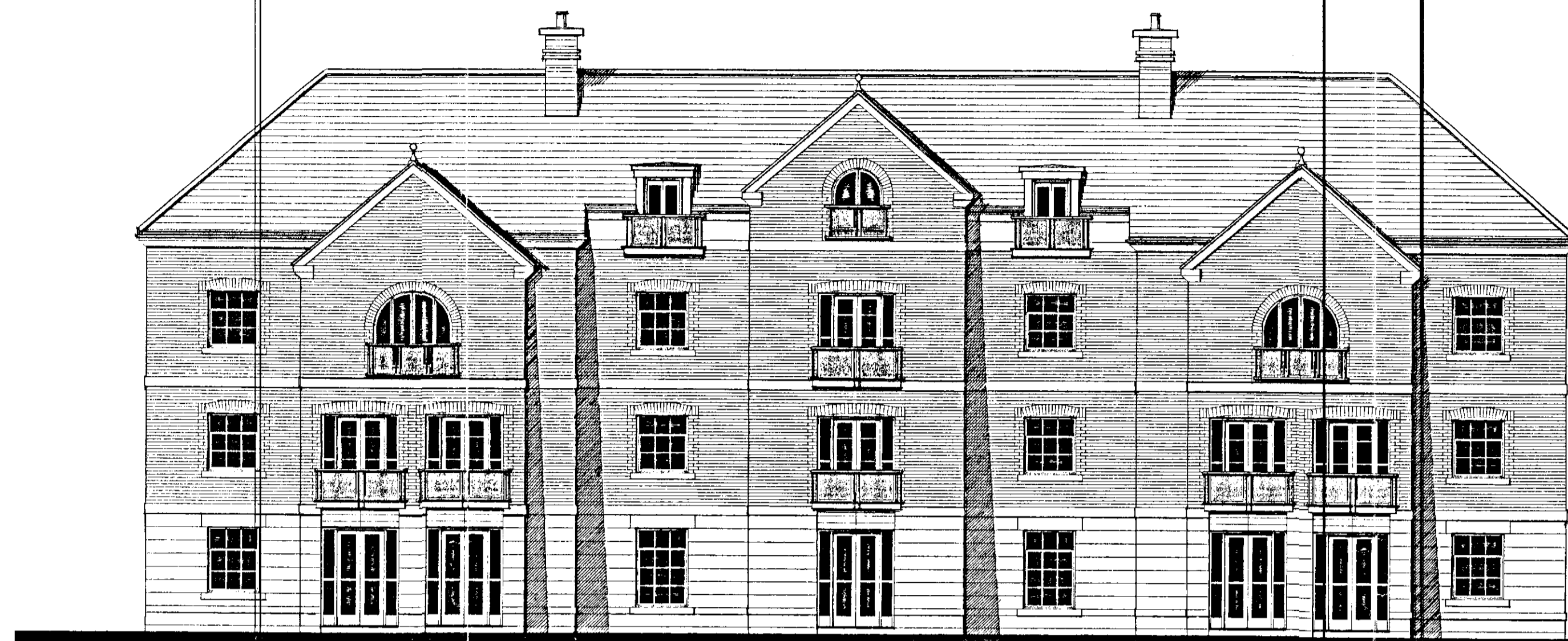
Front Elevation 1:100 as proposed

© COPYRIGHT ALL RIGHTS RESERVED THIS DRAWING MUST NOT BE REPRODUCED, IN WHOLE OR IN PART WITHOUT PERMISSION.